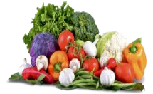
Harvest ANY fruits or vegetables